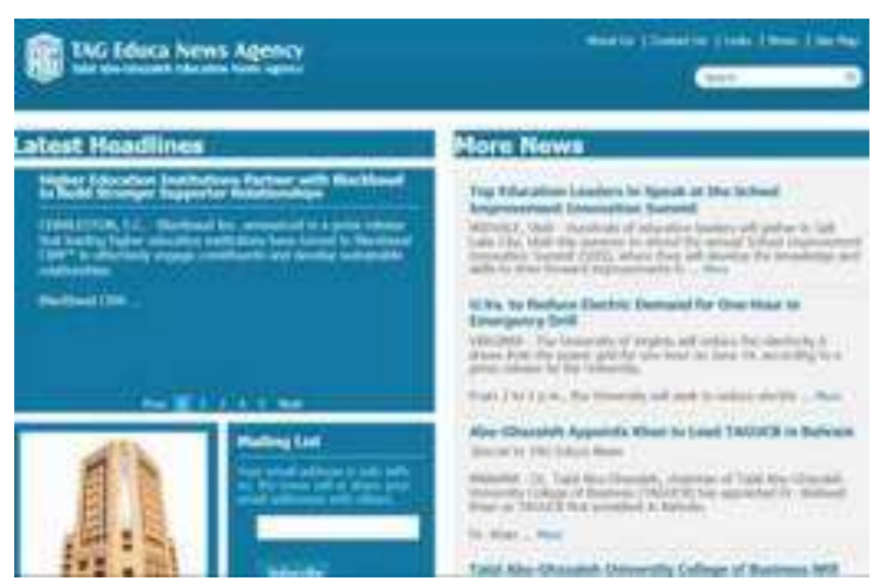
The News Agency will act as a partner to all universities, schools and education outlets in covering their news and activities.

The Talal Abu-Ghazaleh Education News Agency, an independent source of reliable and objective news on education around the world, was launched.